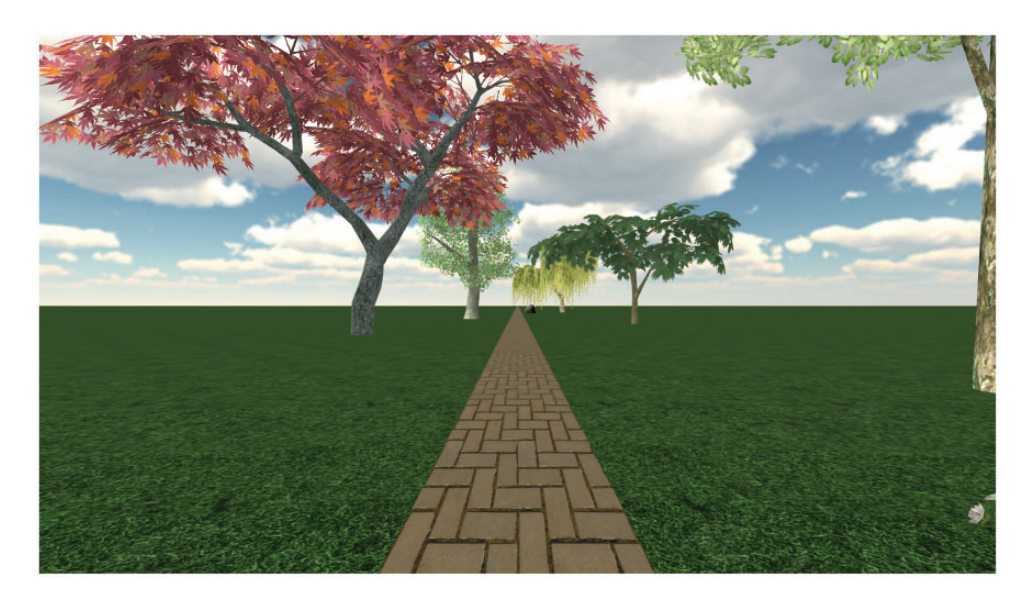
Figure 1. An Example of the Virtual Geographical Hill Slant Display Presented to Participants. Note. Please refer to the online version of the article to view the figures in colour.

due to the necessity for visually guided actions to accommodate to the environment, measures of explicit awareness tend to reflect perception of identification (Proffitt, 2009). However, haptic measurements, such as palm board adjustments, rely on heuristics that bypass the need to represent spatial layout (Fajen, 2007) and, therefore, tend to be a result of perception for action (Creem, & Proffitt, 1998; Proffitt, 2009). On completion of slant estimation in the first optic flow condition, participants repeated the procedure with the other optic flow condition.